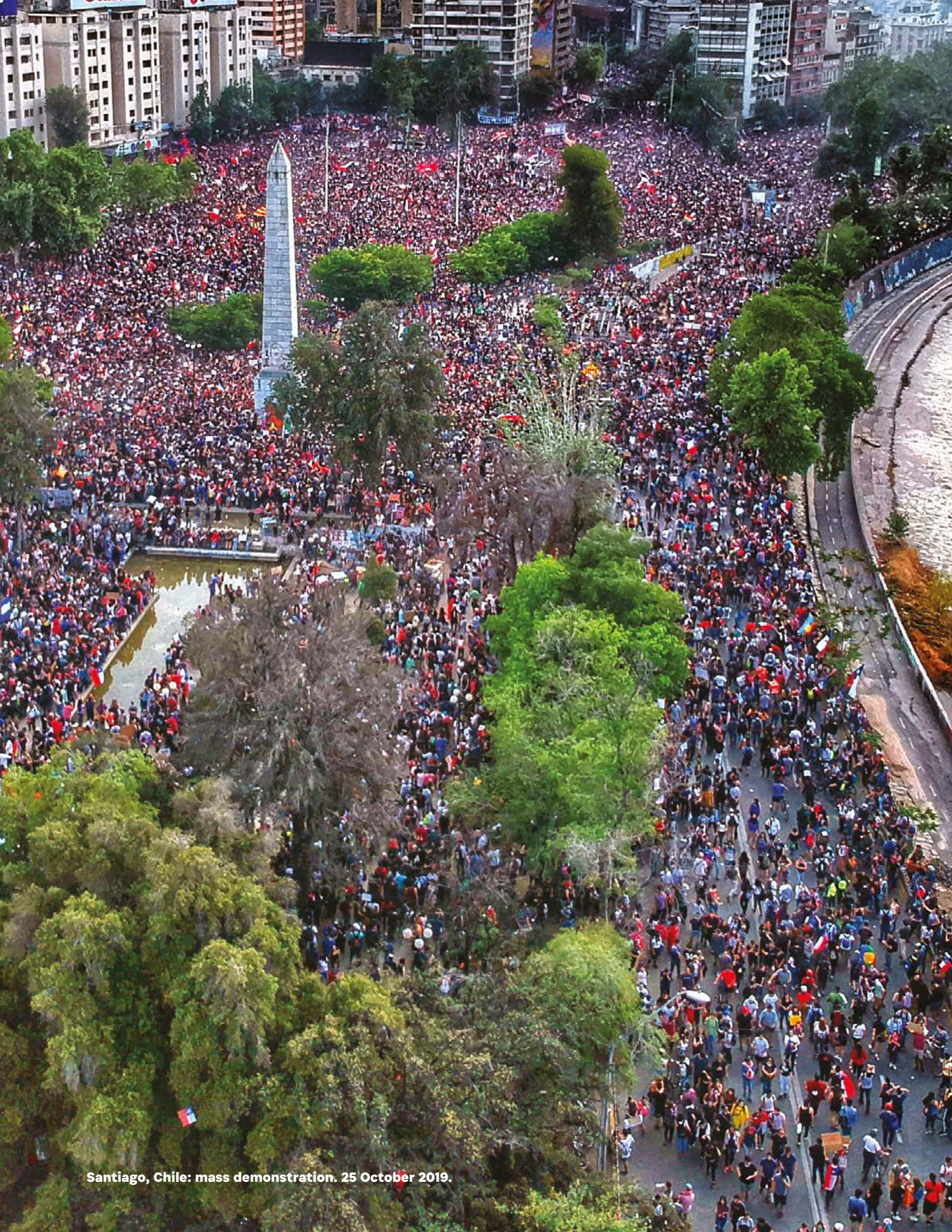
Santiago, Chile: mass demonstration. 25 October 2019.